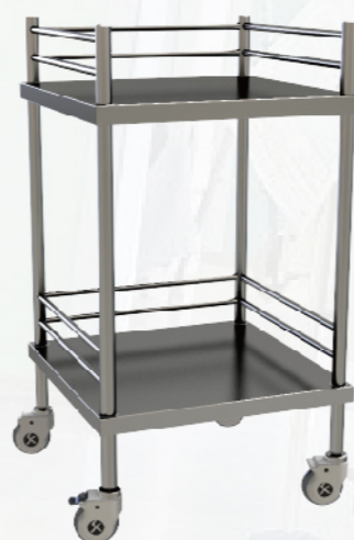
Treatment Trolley SKH003-2