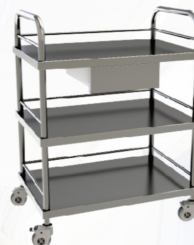
Instrument Trolley SKH004-1 Size: 670*450*900mm