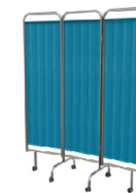
SKH049-3 Three fold with curtains