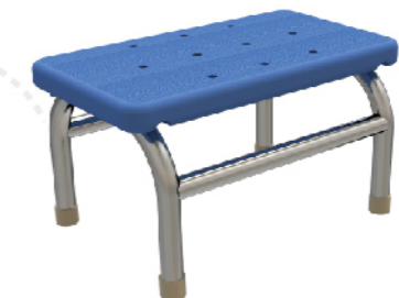
Step Stool SKE020-4