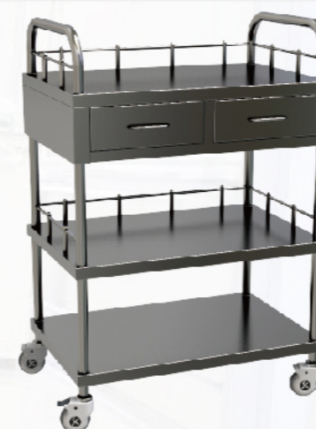
Treatment Trolley SKH006-101 Size: 670*450*1000mm