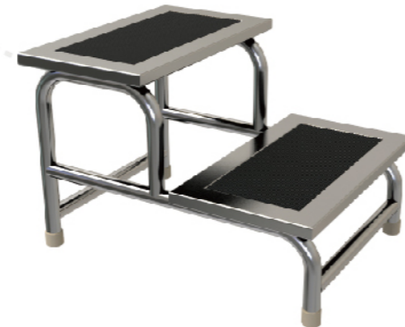
Step Stool SKE020-2D