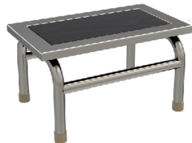
Step Stool SKE020-3