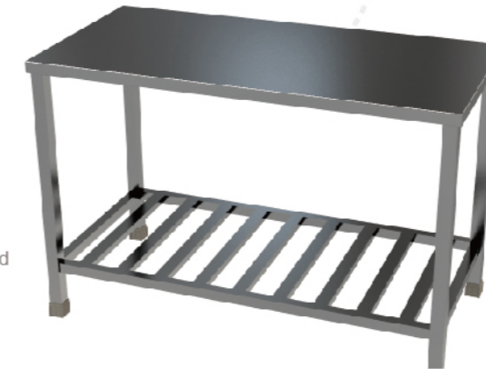
Work Table SKH070 Size(L*W*H): 1200*600*800mm