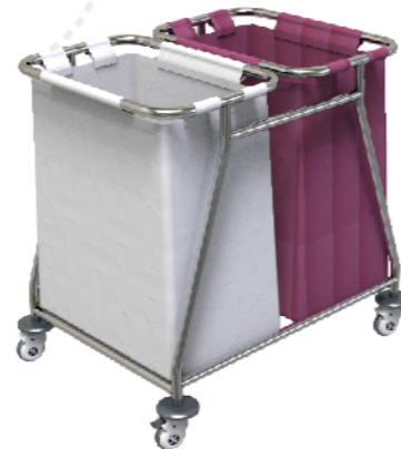
Laundry Trolley SKH040-1 Size: 800*600*840mm