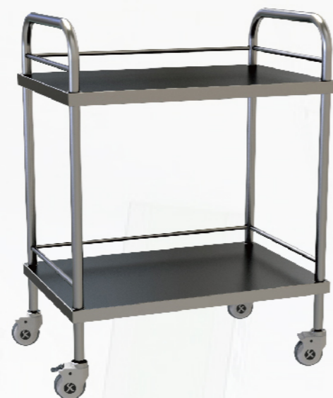
Dressing Trolley SKH002 Size: 670*450*900mm