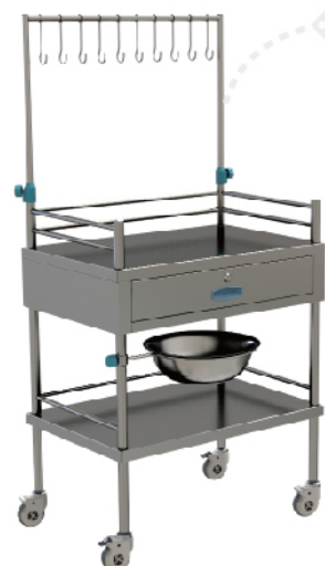
Infusion Treatment Trolley SKH032

Size: 670*450*1000mm With armrests: 790*450*1000mm