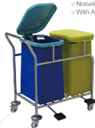
Waste Collecting Trolley SKR-WC562 Size: 800*590*890mm