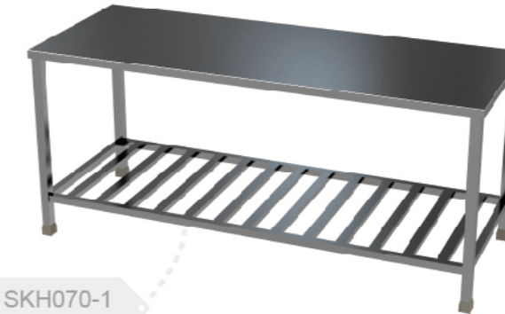
Work Table SKH070-1 Size(L*W*H): 1800*700*800mm