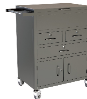
Emergency Trolley SKH021 Size: 600*400*850mm With armrests: 700*400*850mm