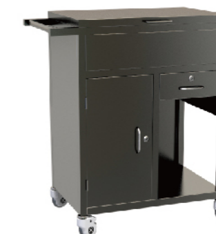
Emergency Trolley SKH019 Size: 600*400*850mm With armrests: 700*400*850mm