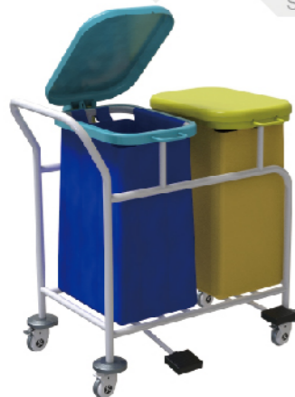
Waste Collecting Trolley SKR-WC561 Size: 800*590*890mm