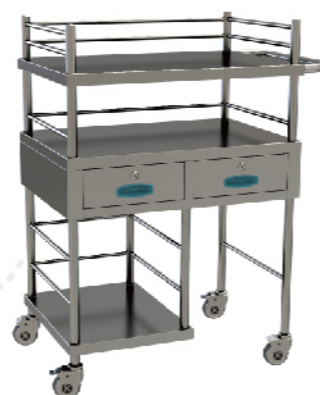
Medicine Trolley SKH028

Size: 670*450*1000mm With armrests: 790*450*1000mm