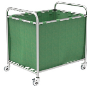
Laundry Trolley SKH040 Size: 800*600*840mm