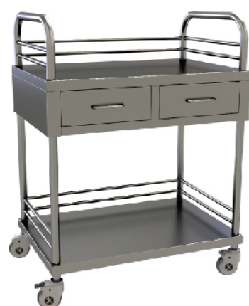
Treatment Trolley SKH006-1 Size: 670*450*900mm