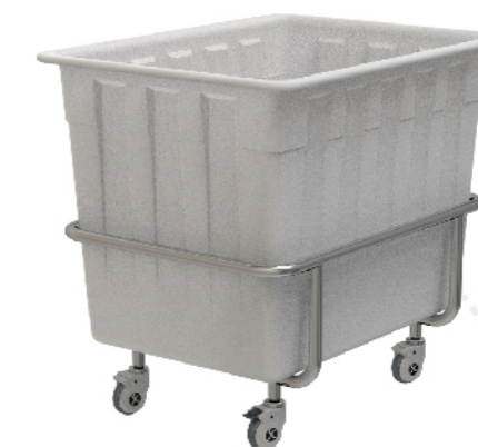
Wet Linen Trolley SKH105

Size: frame: 765*555*420mm(highly wheeled) Barrel diameter: 815*610*580mm