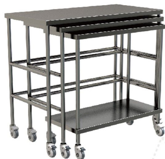
Stainless Steel Trolley SKH007-1 Can buy it separately