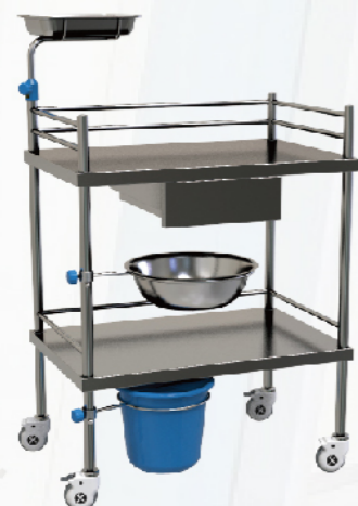
Dressing Trolley SKH002T Size: 670*450*900mm