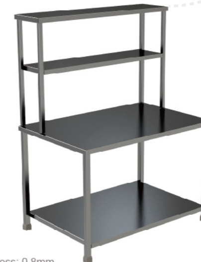
Work Table SKH077 Size(L*W*H): 1200*800/300*1600mm