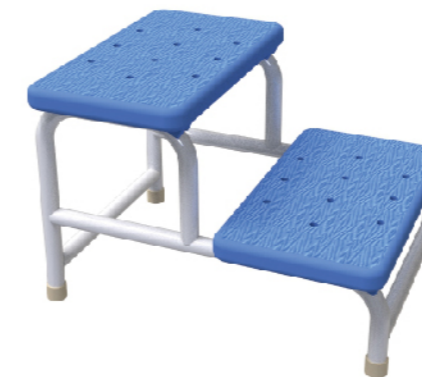
Step Stool SKE020-4D