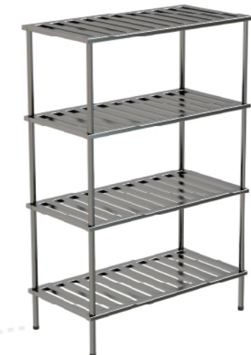
Shelf With Four Layers SKH078 Size(L*W*H): 1200*600*1800mm