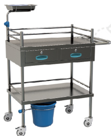
Dressing Trolley SKH029

Size: 670*450*900mm With armrests: 860*450*900mm