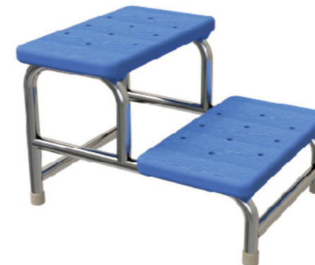
Step Stool SKE020-1D