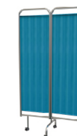
SKH049-2 Two fold with curtains