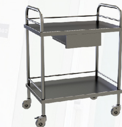
Treatment Trolley SKH001 Size: 670*450*900mm