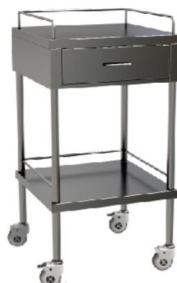
Treatment Trolley SKH006-5 Size: 46*46*86mm