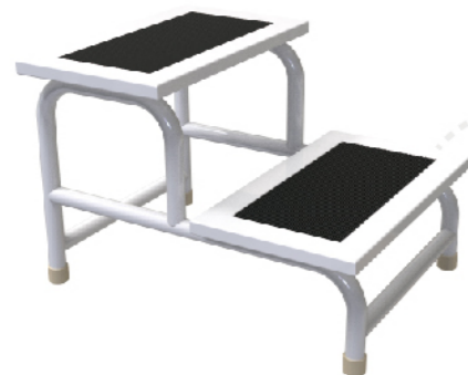
Step Stool SKE020-3D