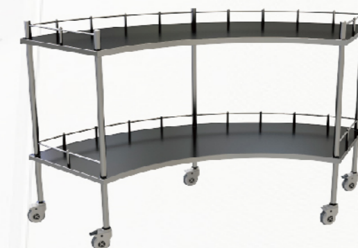
Fan-shaped Instrument Trolley SKH005-1 Size: B: 1550*460*930mm M: 1400*460*900mm S: 1200*460*900mm